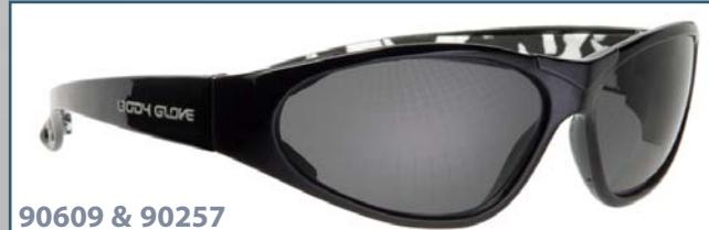
90609 & 90257