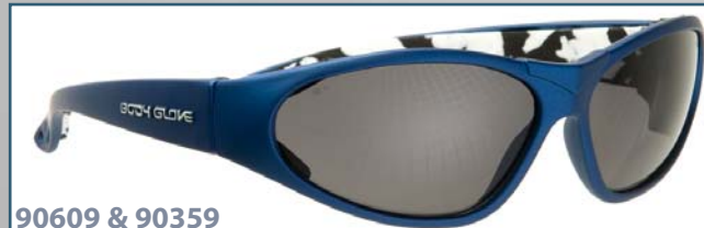
90609 & 90359