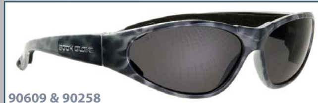
90609 & 90258