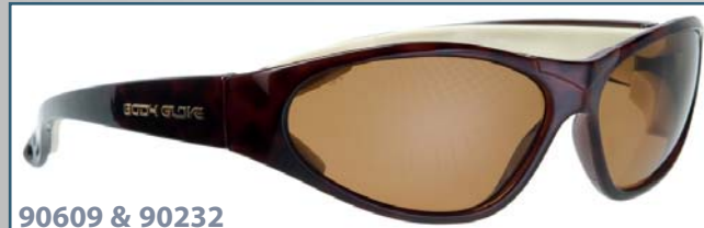
90609 & 90232