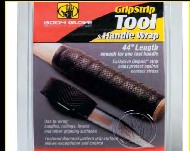
GripStrip Tool Wrap