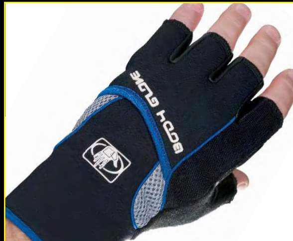
Half Finger Mechanics Glove