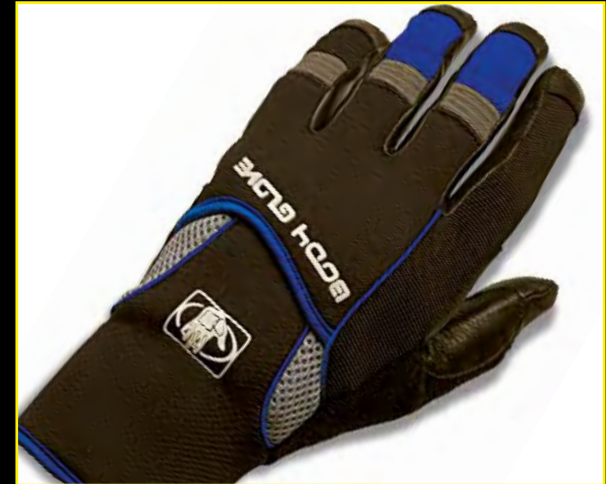
Full Finger Mechanics Glove