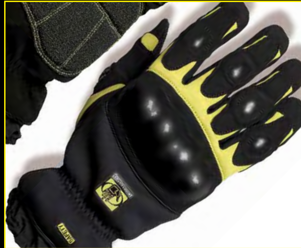
Mechanics Heavy Duty Glove

XS: (Not available for Heavy Duty Glove) 6.5"-7"; S: 7.5"-8"; M: 8.5"-9"; L: 9.5"-10"; XL: 10.5"-11"; XXL: 11.5"-12"