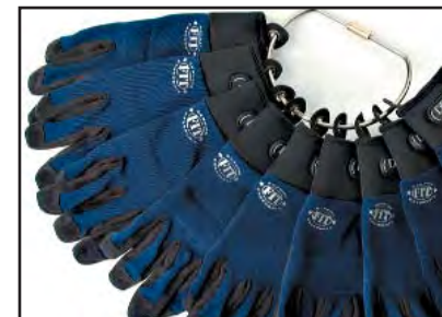
FIT System Glove Sizing Ring Page 9 Part # 49932