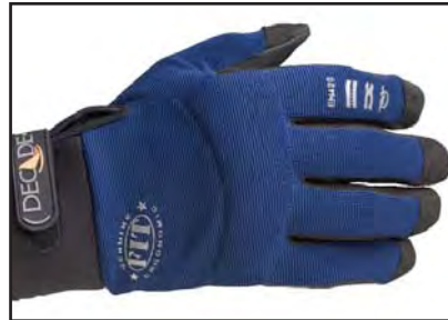
FIT System Full Finger Page 2 Part # 49919-25, 49936-7

XXS: 5.5"-6"; XS: 6.5"-7"; S: 7.5"-8"; M: 8.5"-9"; M/L Cadet: 8.5"-10"; L: 9.5"-10"; XL: 10.5"-11"; XXL: 11.5"-12"; XXXL: 12.5"-13"