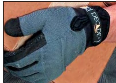
FIT System Box Handler's Page 5 Part # 65359-67