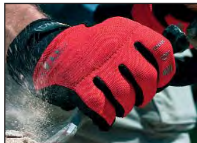
FIT System Shock Impact Page 8 Part # 65409-17