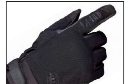
FIT System Tactical Page 7 Part # 65399-65407