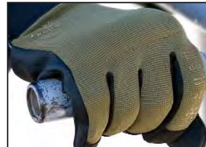
FIT System Cold Weather Page 6 Part # 65369-77