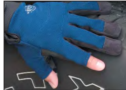
FIT System Clipped Finger Page 3 Part # 49939-47