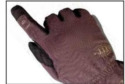
FIT System Slip-On Page 4 Part # 49959-67