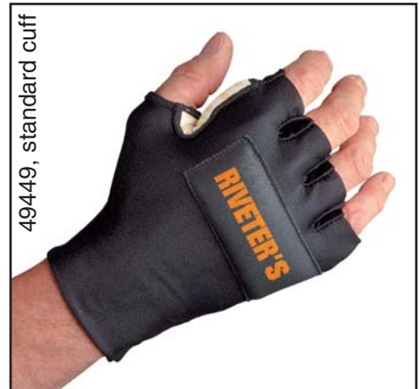
49449, standard cuff

Developed in collaboration with a leading aircraft manufacturer for specific dexterity needs of riveters.