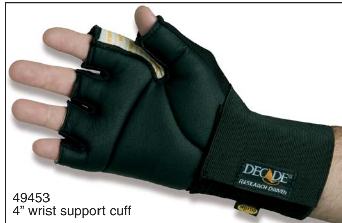
49453 4" wrist support cuff

Sold singly, Left or Right, Sizes XS-M and L-XXL Available with or without wrist support Less than 1 lb. shipping weight. Color: Black